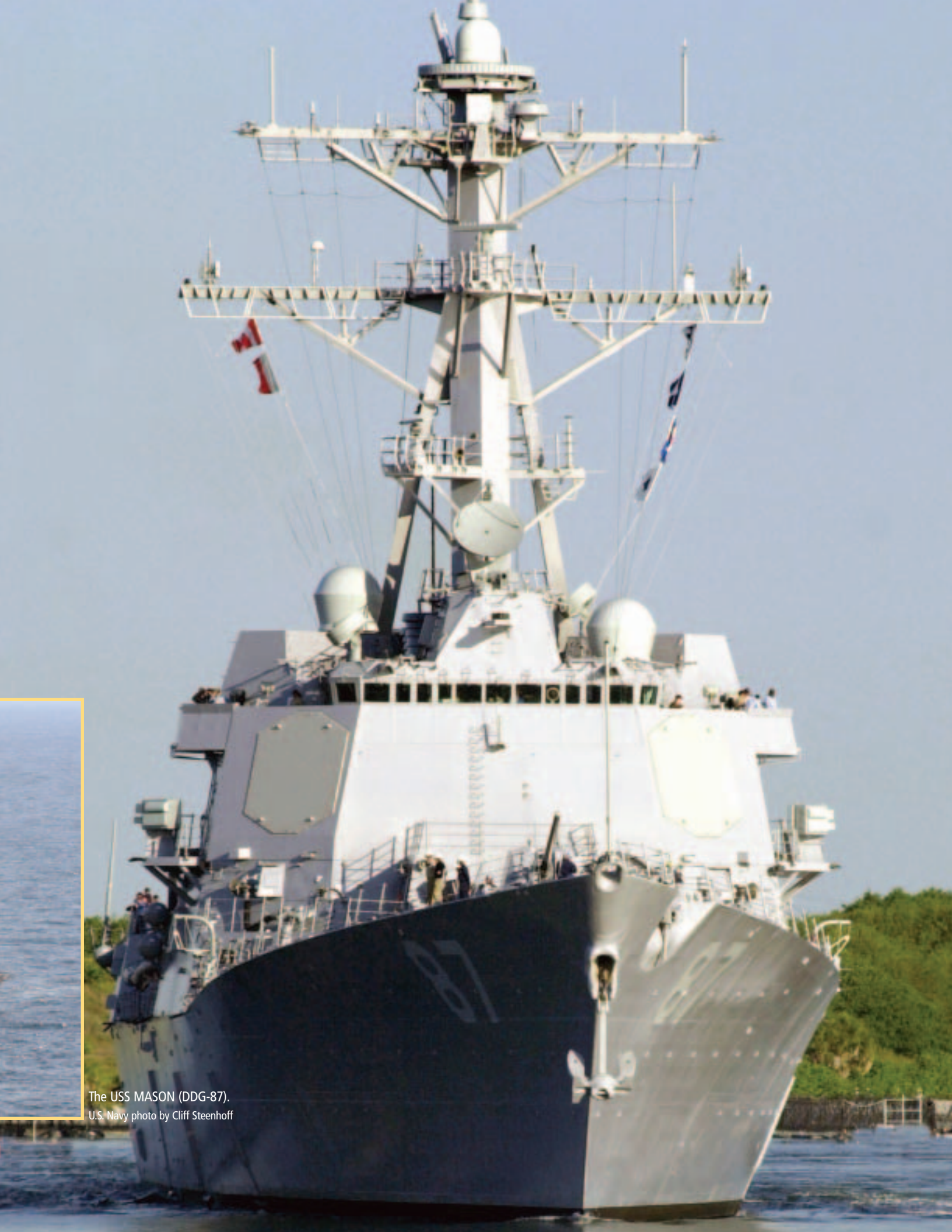
The USS MASON (DDG-87).