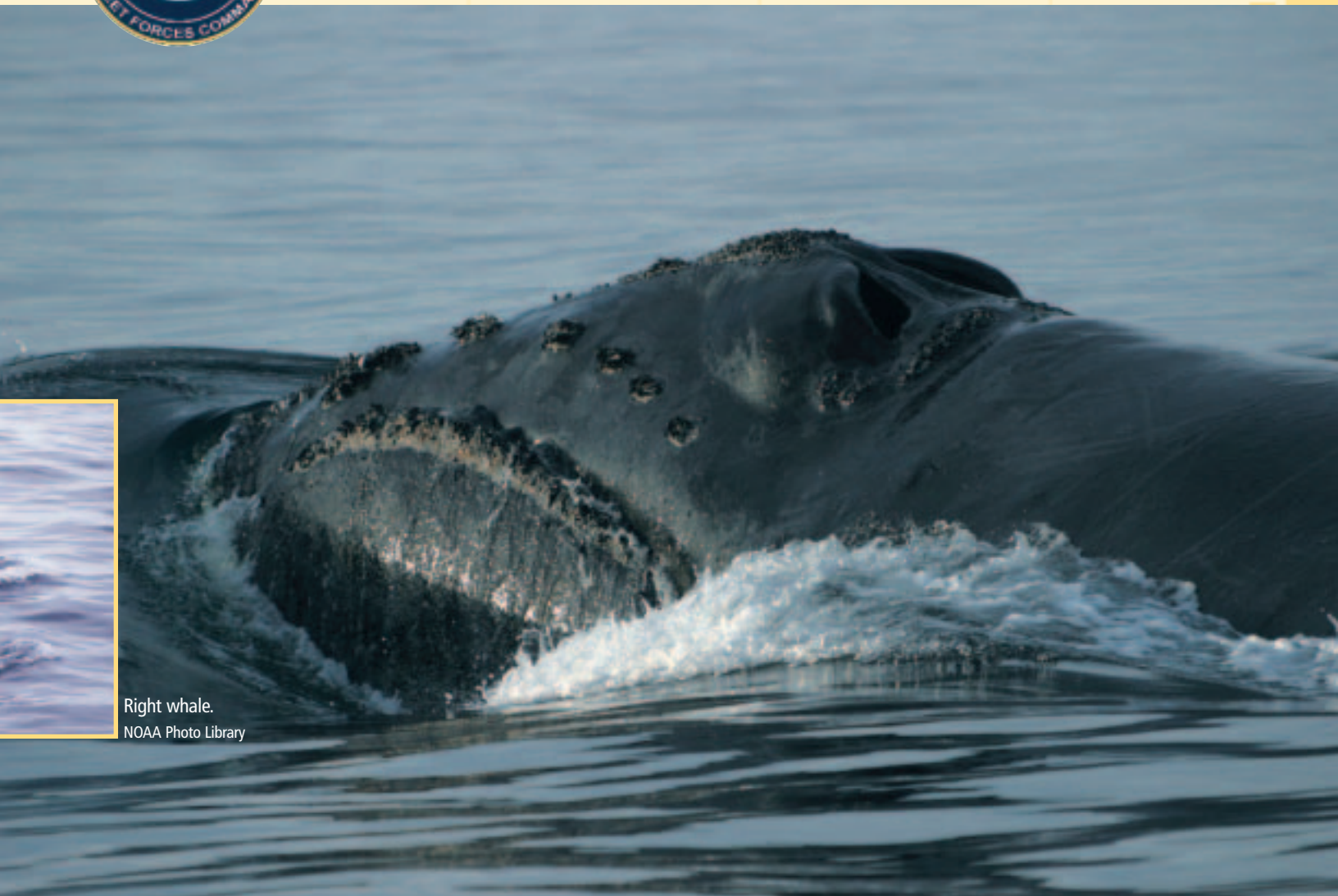
Right whale.