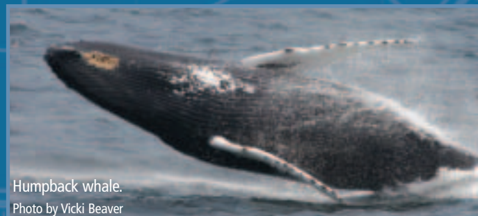
Humpback whale.

that are too quiet to detect passively. By using specialized signals and echo location, the system increases the distance at which submarines can be detected and tracked.