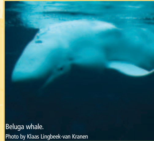
Beluga whale.

Nissen said the Navy is conducting environmental reviews to determine the potential effects of its sonar use in the marine environment.